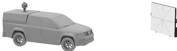
Fig. 2. Graphical concept of work of VED system (direct view of test station)

VED system is Inframet systems optimized for testing EO imaging/laser systems at field/depot conditions. It is built as a set of test systems located at significant distance (typical range 100-200m) from tested EO system that projects reference images to tested EO system or measure properties of laser beams emitted by lasers of tested EO system. simulate real targets during real work of EO system.