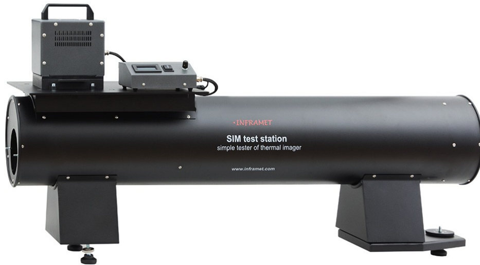
Fig. 1. Photo of SIM110 test system