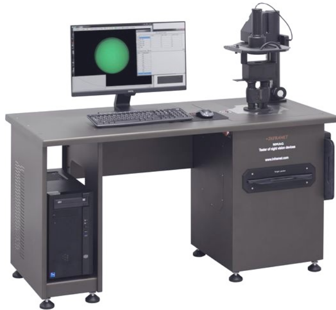
Fig. 1. NMAG test station