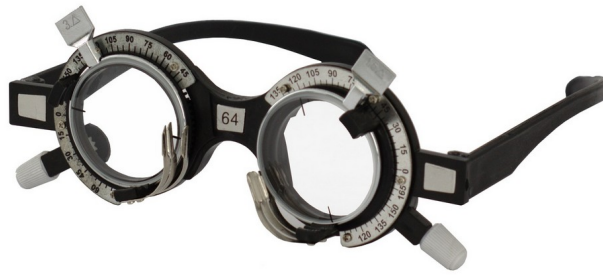
Fig. 1. NCER simulator