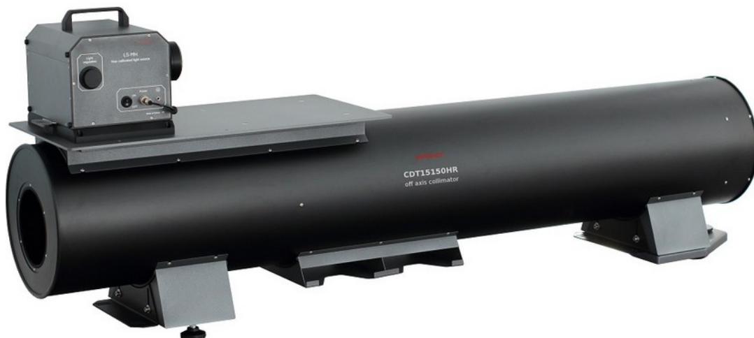
Fig. 1. LS-MAH light source as a part of VINIS test system for testing VIS-NIR cameras