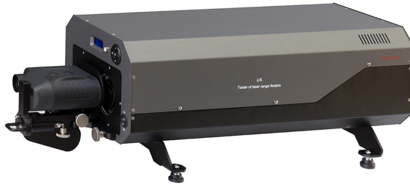
Fig.1. Photo of LIS test station