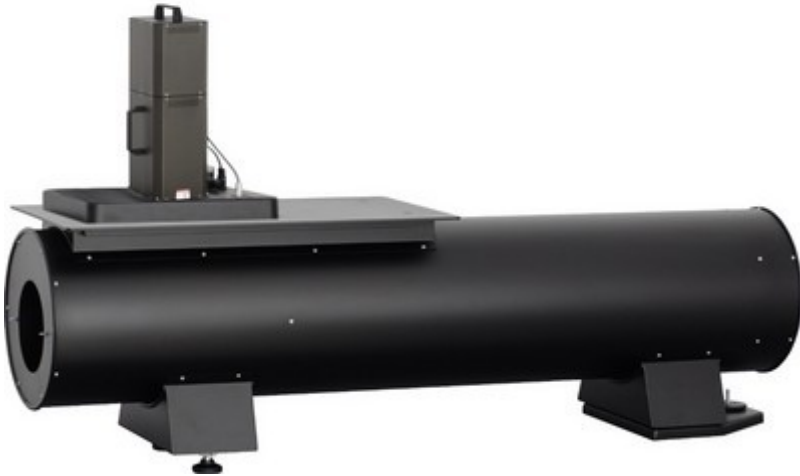
Fig. 1. Photo of LDIR150 test station