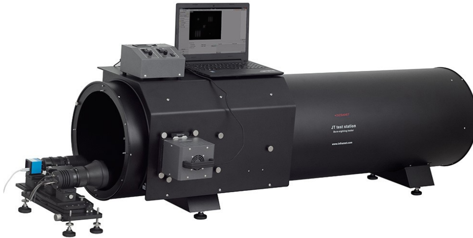
Fig. 1. Photo of the JT400 boresight station