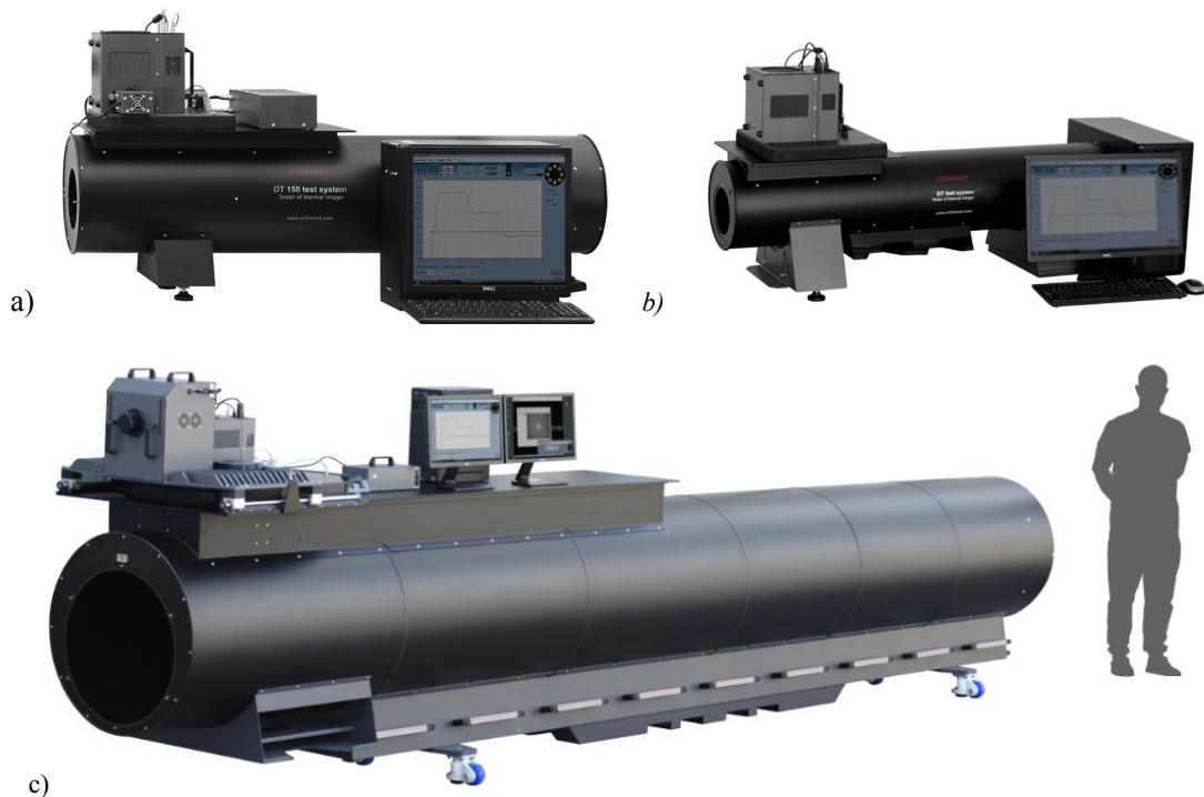
Fig. 1. Photos of three exemplary DT systems: a) most popular DT150 system for testing medium range thermal imagers, b) DT80 for testing short range imagers, c) DT600 system for testing ultra long range thermal imagers