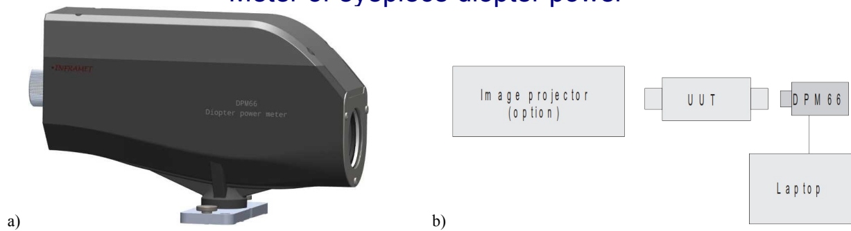
Fig. 1. DPM66 meter: a) drawing, b) work diagram